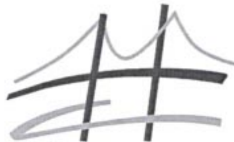
Michigan Humanities Council

Michigan People, Michigan Places Our Stories, Our Lives