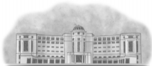
MICHIGAN SUPREME COURT HISTORICAL SOCIETY