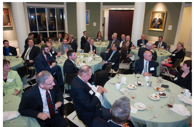
The Dinner was once again a sold out event, filling the sixth floor rotunda outside the Supreme Court's chambers in the Hall of Justice.