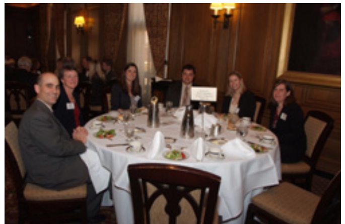
Corporate sponsor Kitch Drutchas Valitutti & Sherbrok are seen sitting at their firm's table.