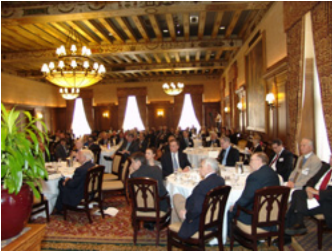
An overview of the DAC's Main Ballroom. There were 125 attendees at this year's luncheon.