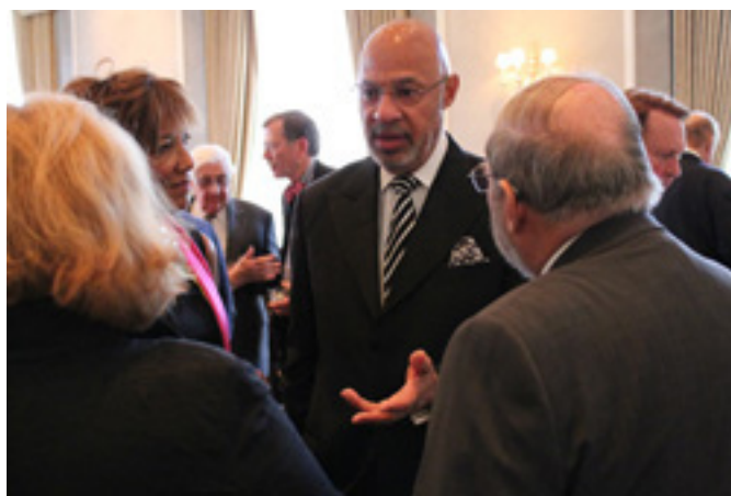
Former Justice Dennis Archer (MSC 1986-1990) was in attendance.

The Society also hosted a special anniversary dinner to thank its board of directors & emeritus members and current & former Supreme Court justices on Friday, May 3rd, at the DAC.