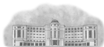
MICHIGAN SUPREME COURT HISTORICAL SOCIETY

1st Floor, Hall of Justice 925 W. Ottawa Street Lansing, MI 48915