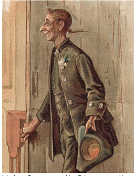
Ichabod Crane painted by Edwin Austin Abbey.