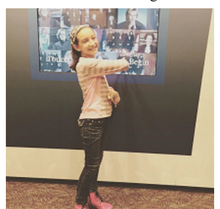
A fourth grade student points out the First Women on the Court exhibit in the Learning Center.

this newsletter with someone you believe would be interested in the work we do. Bring a guest (or buy a table!) to the Annual Luncheon. Or, give the gift of history by purchasing a membership for someone whose name is not yet on our membership roster. Thank you!