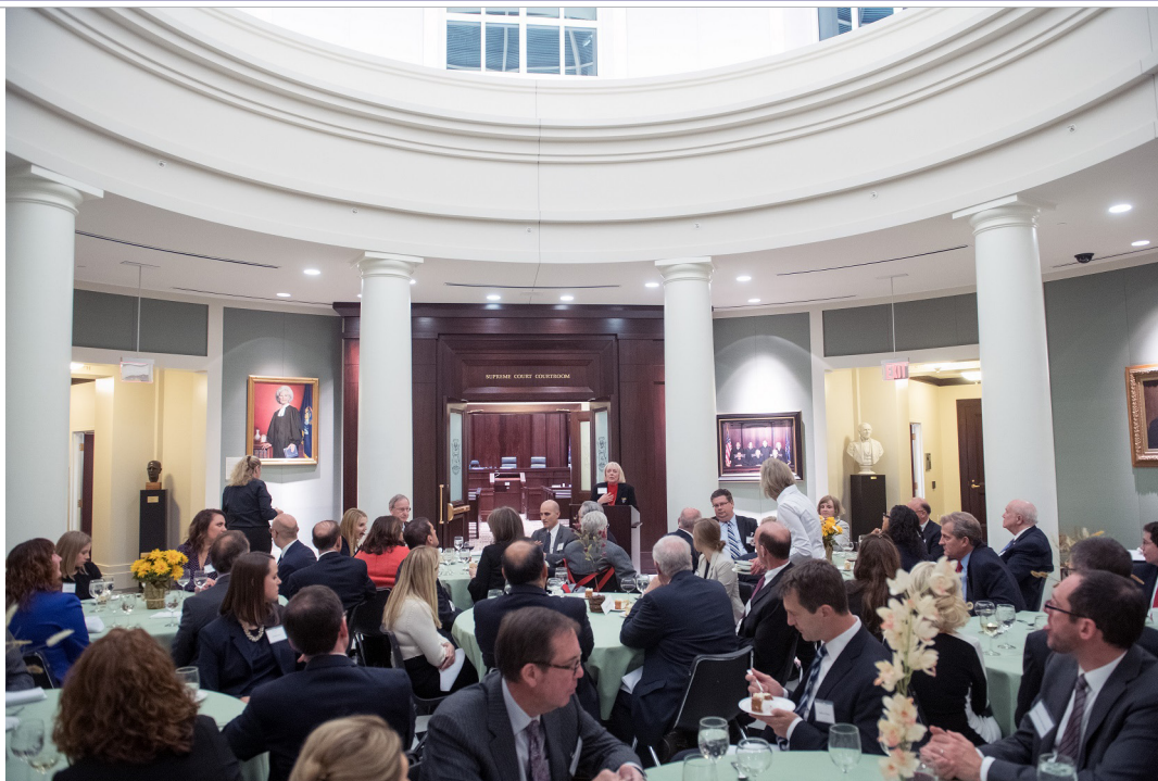
The crowd at this year's Advocates Guild Dinner. Guests dined at one of eight tables set up in the rotunda outside the Courtroom. The Michigan Supreme Court is on the sixth floor of the Hall of Justice.