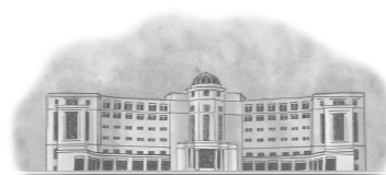
MICHIGAN SUPREME COURT HISTORICAL SOCIETY

1st Floor, Hall of Justice 925 W. Ottawa Street Lansing, MI 48915