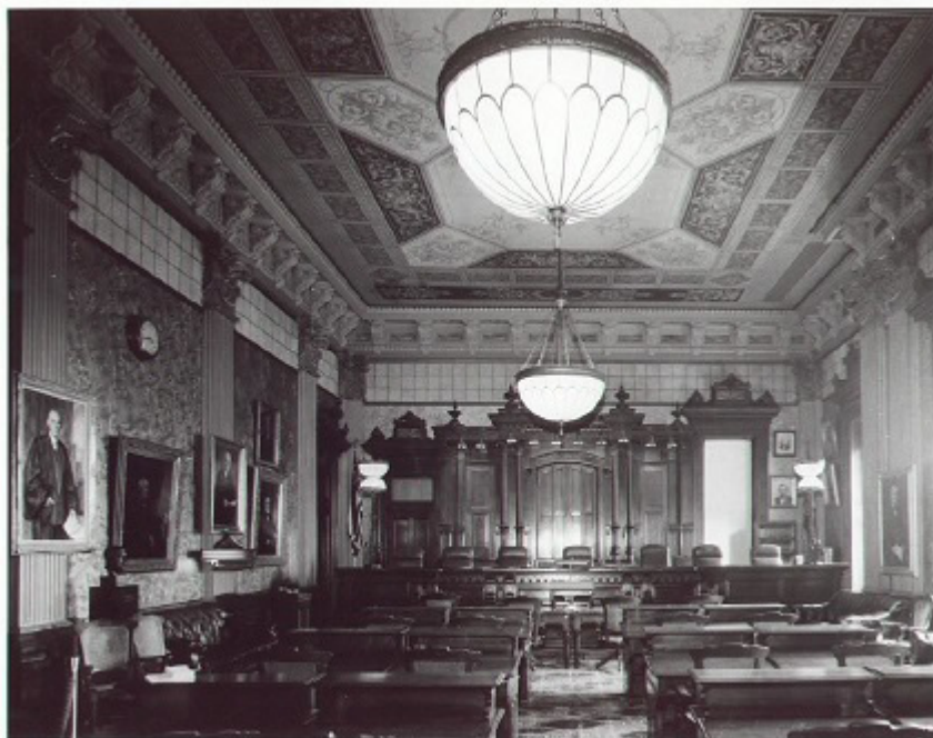
The Old Supreme Court Chambers, where the Michigan Supreme Court met from 1879 to 1970, is located on the third floor of the Michigan State Capitol. This photo from 1961 is courtesy of the Michigan State Capitol Commission.