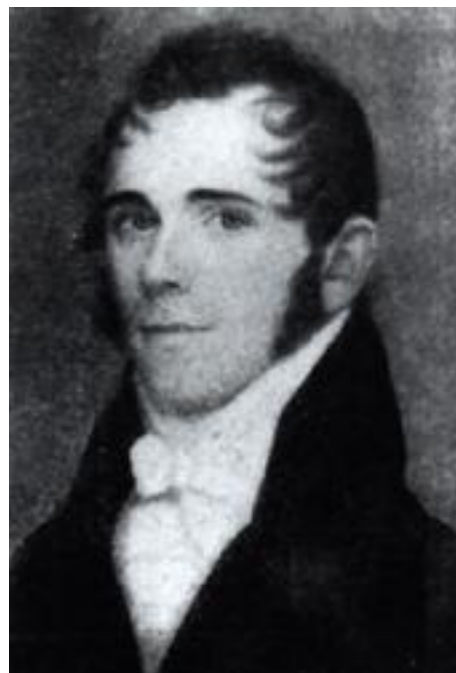
Have YOU seen this portrait? It's been missing from the collection for over 130 years! #findfletcher