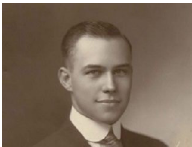
Harry Burn of Tennessee

At this moment a hundred years ago the constitutional amendment for women's suffrage had not yet passed Congress. That happened on June 4, 1919, and Michigan, Illinois, and Wisconsin quickly followed, ratifying on June 10. By the end of the year, however, only 22 states had ratified. It wasn't until August 18, 1920, that legislators in the last state, Tennessee, gathered to vote on ratification. Supporters and opponents from throughout the world had converged on Nashville.