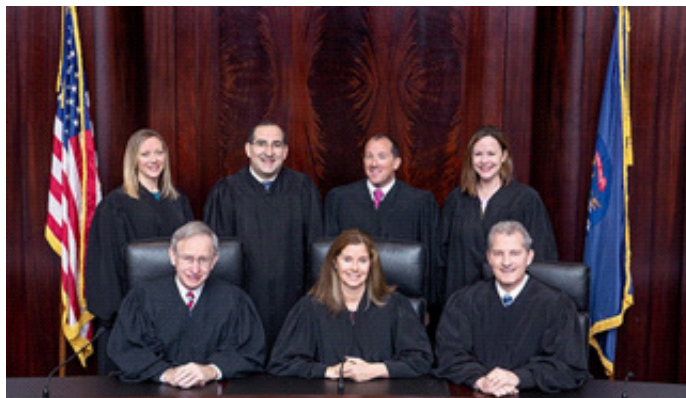
The 2019 Court, led by Chief Justice Bridget McCormack (center).