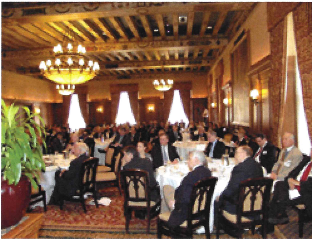
An overview of the DAC's Main Ballroom. There were 125 attendees at this year's luncheon.