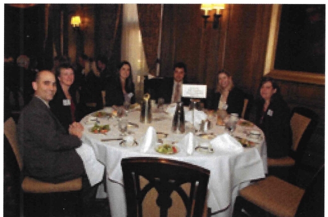
Corporate sponsor Kitch Drutchas Valitutti & Sherbrok are seen sitting at their firm's table.