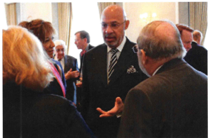
Former Justice Dennis Archer (MSC 1986-1990) was in attendance.

The Society also hosted a special anniversary dinner to thank its board of directors & emeritus members and current & former Supreme Court justices on Friday, May 3rd, at the DAC.