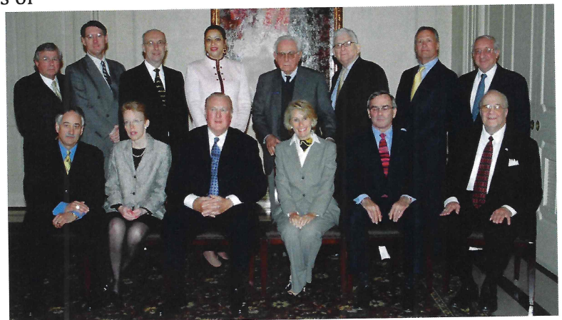
2005 Board of Directors