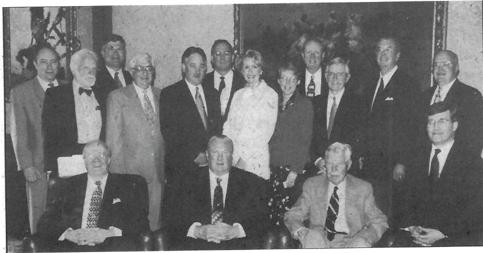
1998 Board of Directors

"The mission of the Michigan Supreme Court Historical Society is to collect, preserve, and display documents, records, and memorabilia relating to the Michigan Supreme Court and the other Courts of Michigan, promote the study of the history of Michigan's courts, and seek to increase public awareness of Michigan's legal heritage."