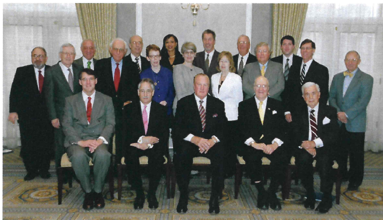
2009 Board of Directors