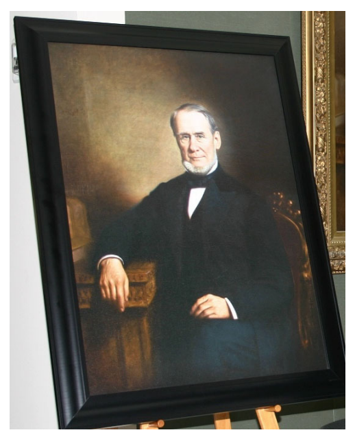
Dedicated June 7, 2011

The reproduction portrait is a highquality digital photo printed onto canvas. The canvas is certified to exceed standards for pH and lightfastness, thus ensuring its archival quality. It was produced by Capital Imaging of Lansing.