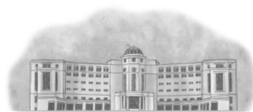
MICHIGAN SUPREME COURT HISTORICAL SOCIETY

E-mail CPICKETT@MICOURTHISTORY.ORG Website: WWW.MICOURTHISTORY.ORG